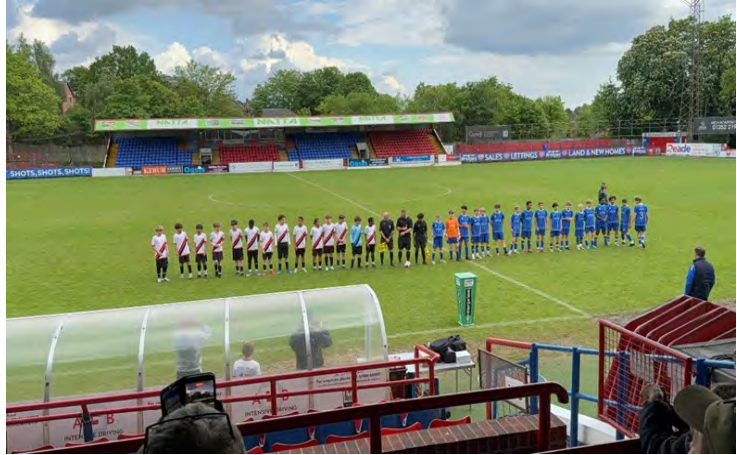
Above and below: The teams at Aldershot

Interestingly, last season St George's lifted the Southampton Cup while Deer Park claimed the league title — this year, the honours were reversed.