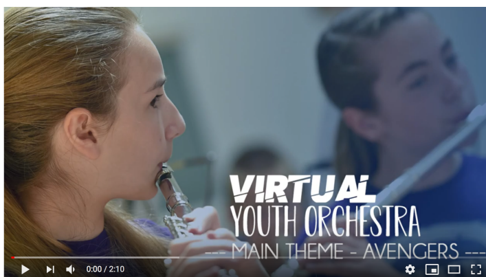
Avengers Main Theme - Showcase Virtual Youth Orchestra

Performances are available to view on YouTube by searching Virtual Youth Orchestra.