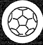
After breaks & sport activities