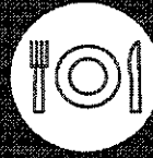
Before cooking & eating