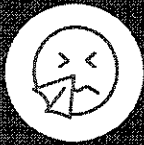
Catch it with a tissue