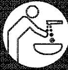
Kill it by washing your hands with soap & water or hand sanitiser