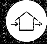
Before leaving home