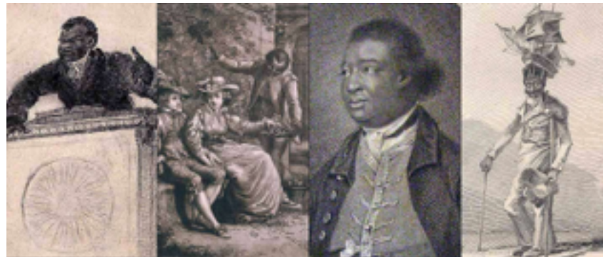
BLACK PEOPLE IN LATE 18TH- CENTURY BRITAIN