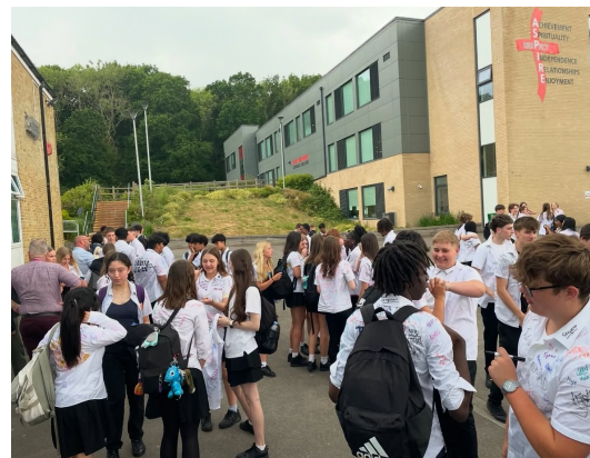
Year 11 shirt signing after their Leaver's Mass.

We look forward to welcoming them back as we celebrate their GCSE success on results day: Thursday 21st August.