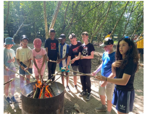
Cooking marshmallows over an open fire.