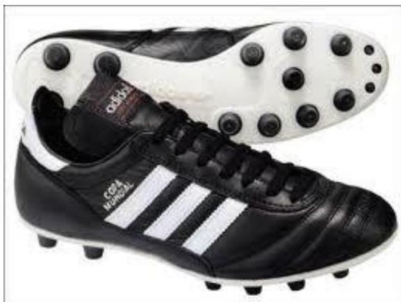
Plastic moulded football boots Astro trainer