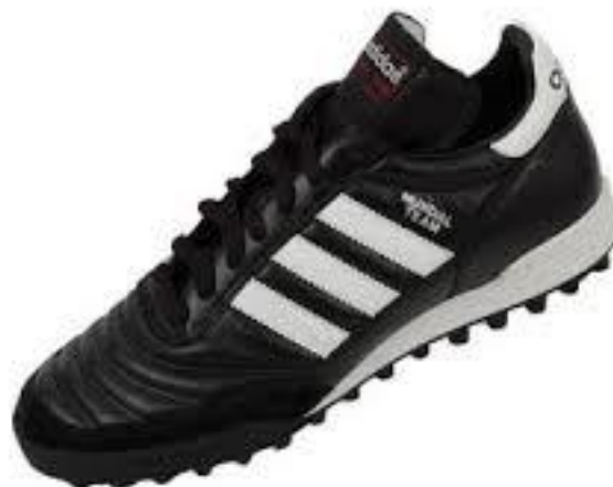
(Rubber sole with dimpled profile)