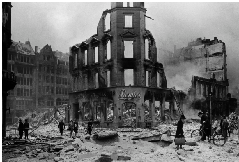
Source 1: the city of Hamburg after an Allied bombing raid in July 1943 i

War production became a priority as a long war seemed likely. By the summer of 1940, 50 per cent of German workers were involved in war production and the proportion of women workers increased dramatically, reversing key Nazi policies of the 1930s. The number of women working in heavy industry increased by a third between 1939 and 1941. The production of armaments was at first made the responsibility of Dr Todt (the man who had built the Autobahnen in the 1930s). He was killed in a flying accident in 1942 and was replaced by Hitler's favourite architect, Albert Speer. Speer not only streamlined war production but also ruthlessly employed slave labour from prisoners of war and the occupied territories. By the end of the war, 7 million non-German men and women were working in Germany. By 1944 German war production had improved tremendously, but by then it was too late as Germany could not compete against the massive combined war productions of Britain, the USA and the USSR.