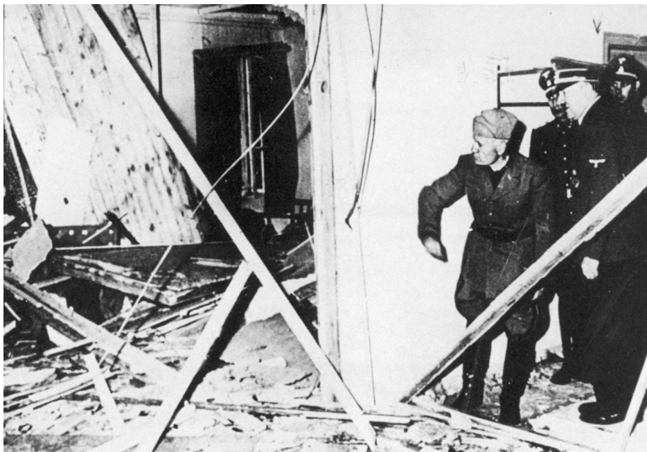
Source 2: Hitler shows Mussolini the wreckage caused by the July Plot in 1944 ii

A more serious attempt was made by officers of Army Group Centre in Russia in 1943 but the bombs they placed on Hitler's aircraft failed to detonate. In 1944 a group of army officers plotted to kill Hitler as Germany's defeat looked inevitable. A bomb was placed in Hitler's headquarters by Colonel von Stauffenberg. The conspirators planned to start a coup in Berlin as soon as Hitler's death was announced. However, the assassination attempt on 20 July 1944 was bungled: the bomb injured Hitler, but failed to kill him, and the attempted coup in Berlin was a fiasco. Within 24 hours the SS and Gestapo had regained control. Hitler's revenge was swift: 200 members of the plot were executed. Many were hanged slowly from meat hooks with piano wire, the executions filmed for Hitler and his cronies to watch over and over again. Famous soldiers like Field Marshal Rommel, who knew of the plot, were persuaded to commit suicide. Even if the plot had succeeded, it is highly unlikely it would have made any difference to the end of the war: the Allies were insisting on unconditional surrender whoever was in charge in Germany.