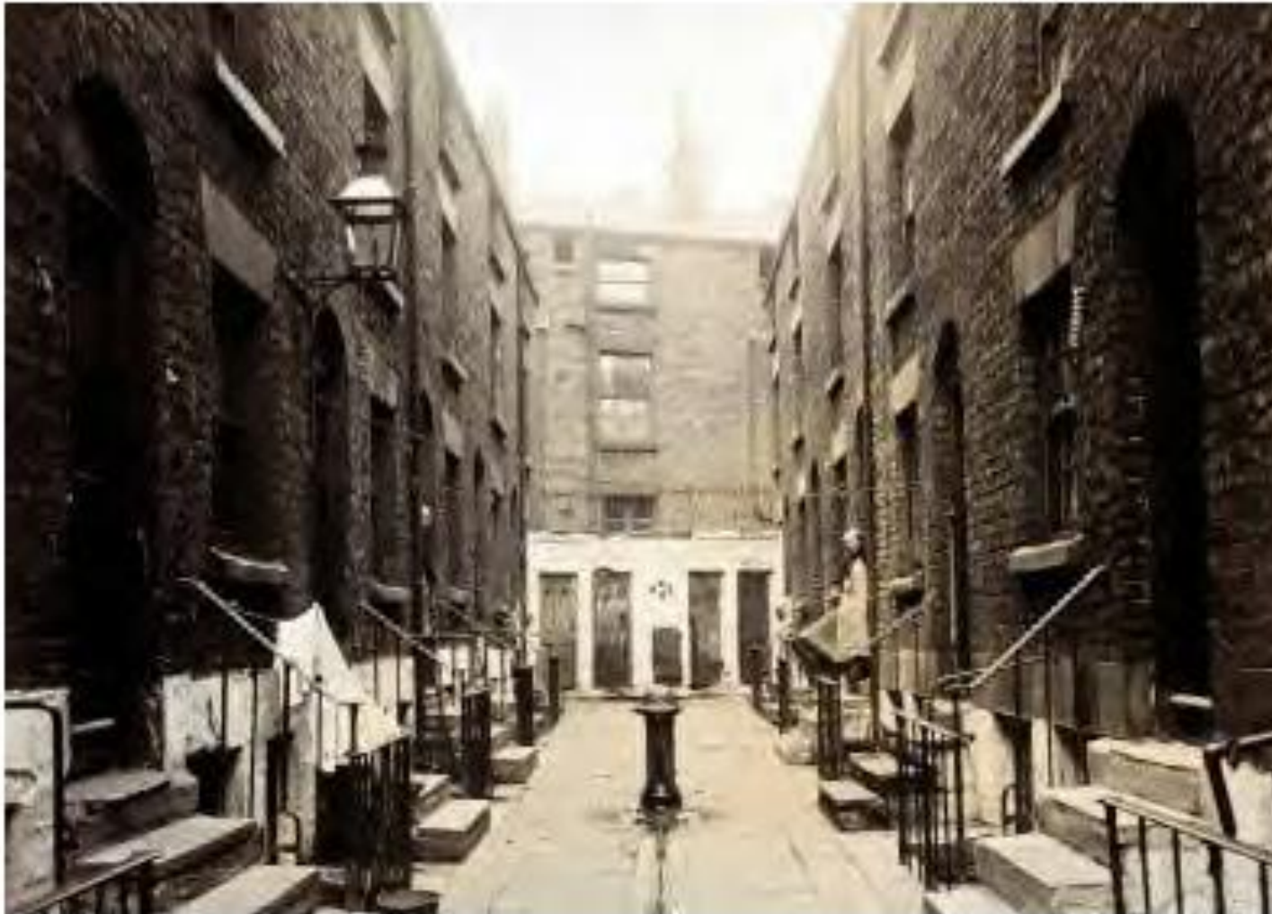
Slum areas of Liverpool: This view of the court, which was in the Rathbone Street area, shows washing lines. Graffiti on the door can also be seen - it says 'God Bless The Pope'.