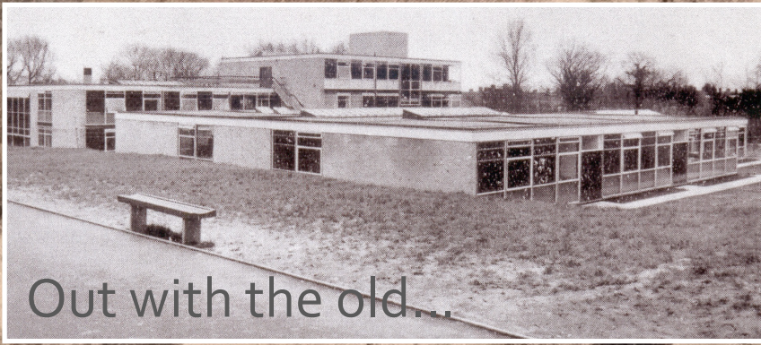
Out with the old...