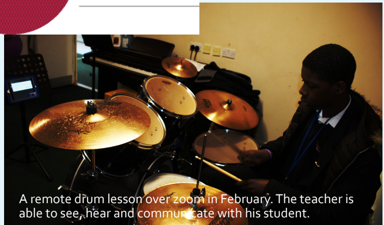
A remote drum lesson over zoom in February. The teacher is able to see, hear and communicate with his student.